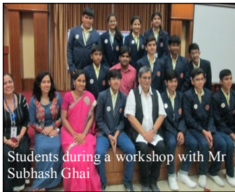
Students during a workshop with Mr Subhash Ghai

For National Youth Film Festival our school was selected for the screening on 5 th – 7 th December at GOA. 25 films had been shortlisted from more than 120 films received from 32 cities & 23 states. The participating team attended the festival as delegates. The idea of short film making was innovative and the competition an exciting one. Students as well as teachers & instruc-